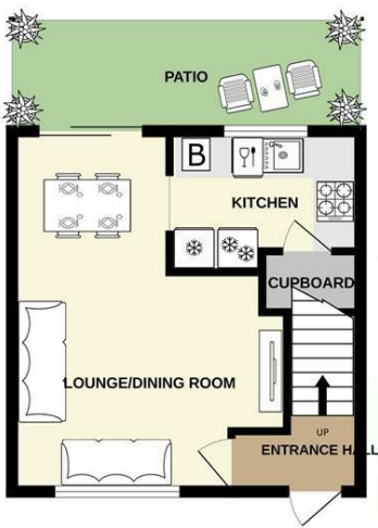
1ST FLOOR 292 sq.ft. (27.1 sq.m.) approx.